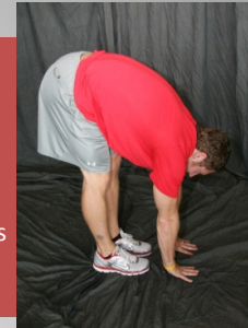
Inch worm 2 x 10 yds