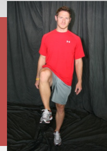
Close the Gate 2 x 10 yds