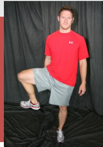
Open the Gate 2 x 10 yds