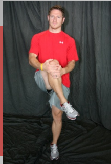
Knee Hug 2 x 10 yds